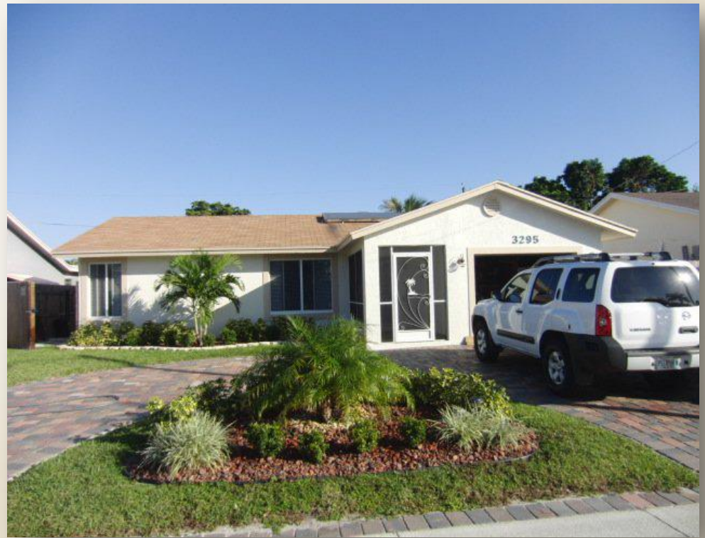
Broward County Built 1978 Square Foot 1475